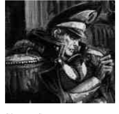
Chief Commissar TENSONED issues Words of Courage & Praise to the XIV Artillery Battery of Guard Regiment TENSORED after the doughty gunners singlehandedly defeated a feeble Ork armoured attack in close combat.

The Emperor's Blessing has just learned that our Wise & Revered Imperator-General (III) after smashing the pathetic Ork herd last week at the Fortress of This has, in a stroke of Emperor Inspired Genius, has ordered the XXIII Army to withdraw from the ravaged battlefield. thus over-extending the Xenos animal rabble even further! High Command expects the pathetic greenskin mob will disintegrate in a matter of weeks.