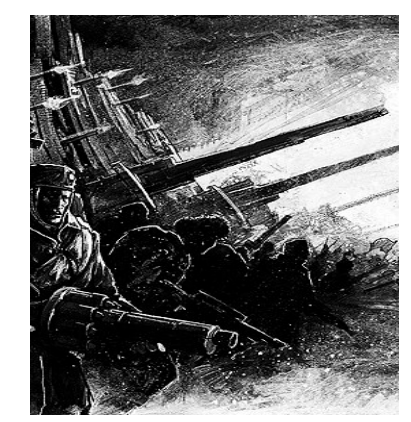
Defend the Walls!